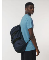
Lightweight Duffle Bag

Shell : Plain Weave , 100% Polyester - Recycled , Fluorine-free DWR , 75 GSM Lining : Taffeta , 100% Polyester - Recycled , 60 GSM