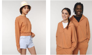
Stella Cropster Wave Terry Globetrotter Wave Terry

Shell : Seersucker Terry , 100% Cotton - Organic Ring Spun Combed , Panel washed , 350 GSM