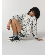
Stella Kicker Tie and Dye

Shell : French Terry , 85% Cotton - Organic Ring Spun Combed , 15% Polyester - Recycled , Fabric washed , Light sueded , 300 GSM