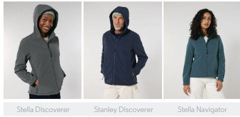
Stella Discoverer Stanley Discoverer Stella Navigator

Shell : Balanced Plain weave , 6% Elastane , 94% Polyester - Recycled , Fluorine-free DWR , 342 GSM