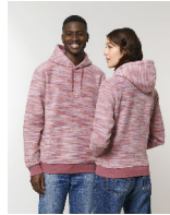
Cruiser Space Dye

Shell : Piqué , 100% Cotton - Organic Ring Spun Combed , Fabric washed , 230 GSM