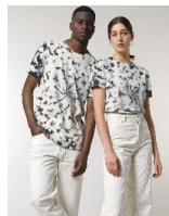
Creator Tie and Dye

Shell : French Terry , 100% Cotton - Organic Ring Spun Combed , Garment washed , Garment dyed , 300 GSM