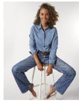
Stella Inspires Denim

Shell : Woven denim , 100% Cotton - Organic Ring Spun Combed , Garment washed , Yarn Dyed , 170 GSM